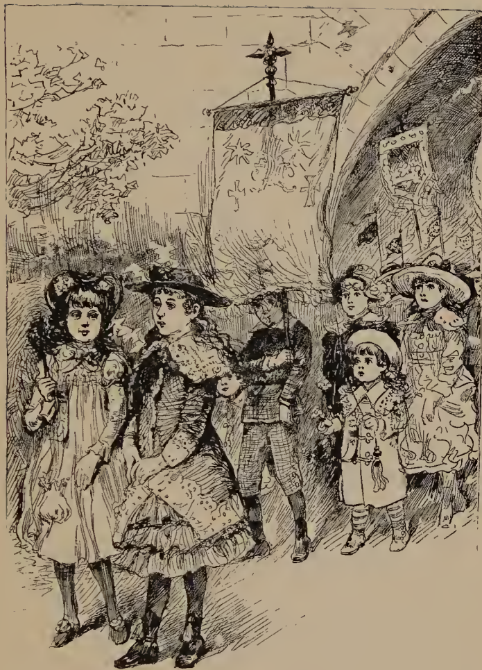
THE MARCH OF THE CHILDREN